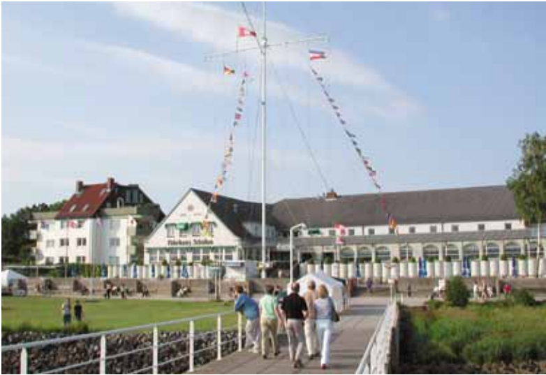
› The Willkomm Höft: every day, between 10 a.m. and 6 p.m., every ship over 1,000 gigatonnes is greeted here