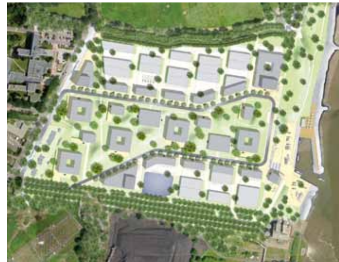
› Business Park development plan from above

The magnificent Business Park Elbufer area has been in active development since February 2012. The sooner you decide to move in to the best location on the Elbe, the better equipped we will be to accommodate your needs.