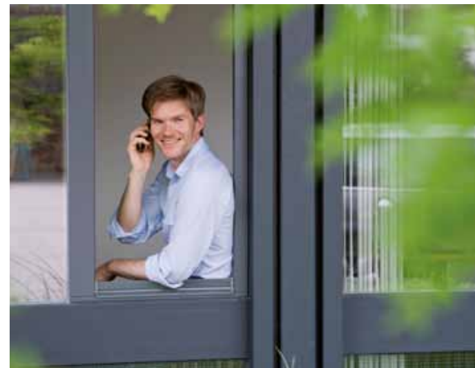
› Work surrounded by nature